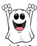
Prizes for Best Dressed