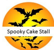
Spooky Cake Stall