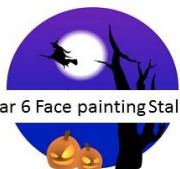
Year 6 Face painting Stall