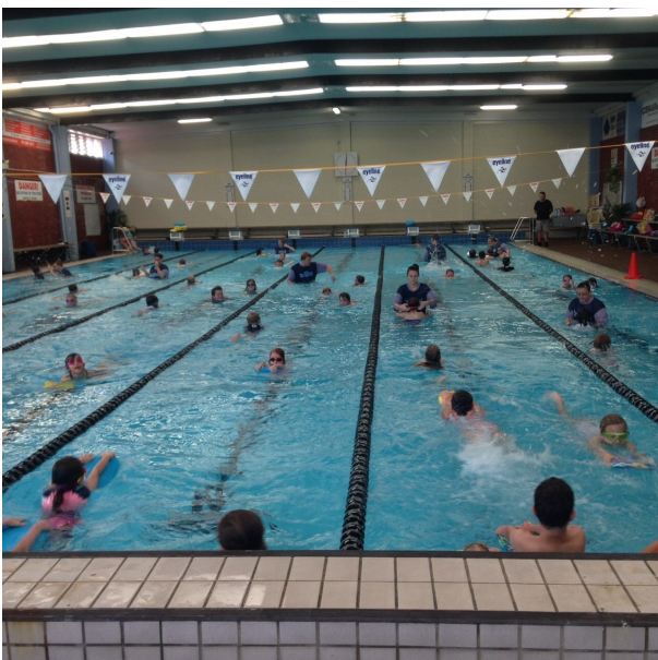
SWIM SCHOOL PHOTOS