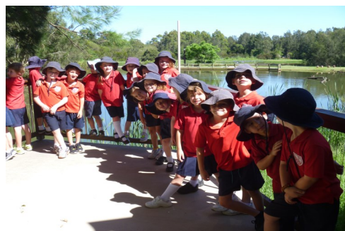
DIP NETTING ON THE JETTY

K-2 students had a fantastic day at the Shortland Wetlands yesterday. We went dip netting, explored the tank room and were junior scientists looking at water bugs under the microscopes. We finished the day walking through the wetlands viewing the native wildlife with our binoculars.