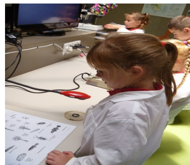
USING CHARTS TO IDENTIFY WATER BUGS UNDER THE MICROSCOPE.