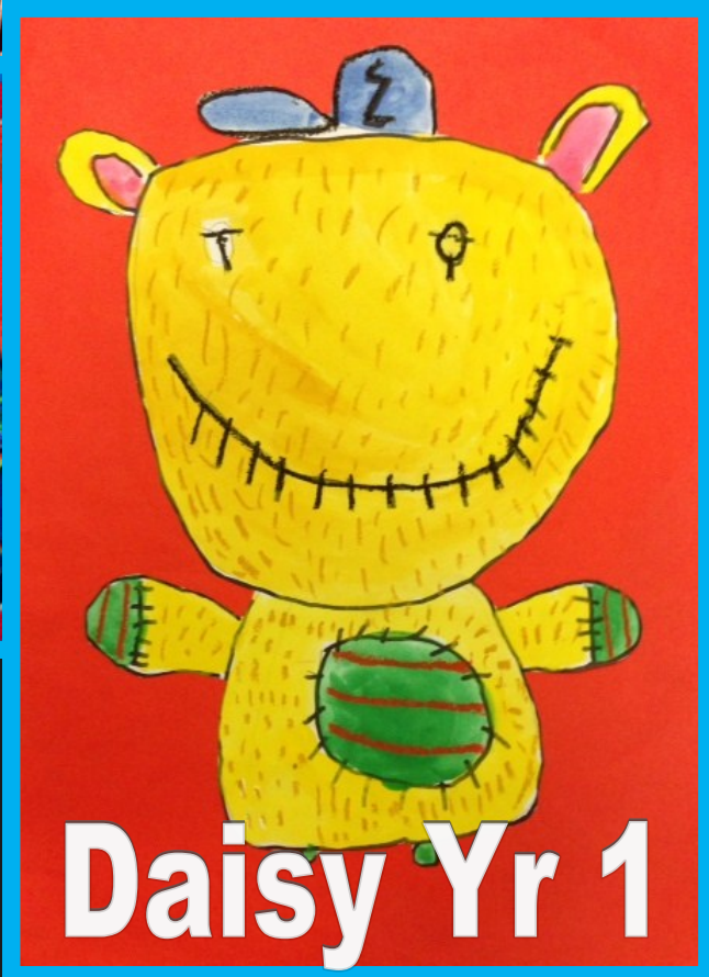
Daisy Yr 1