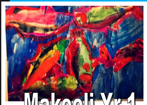
Makeeli Yr 1