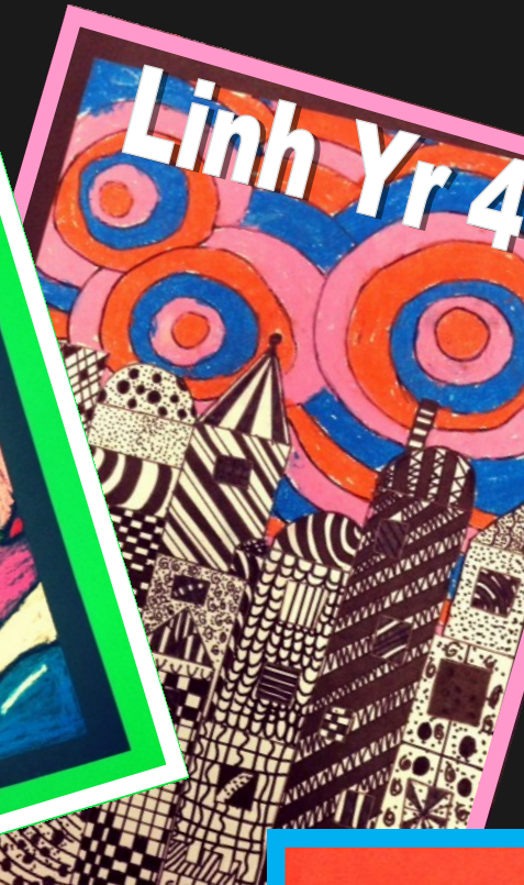
Linh Yr 4