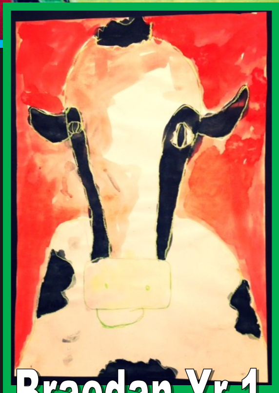
Braedan Yr 1